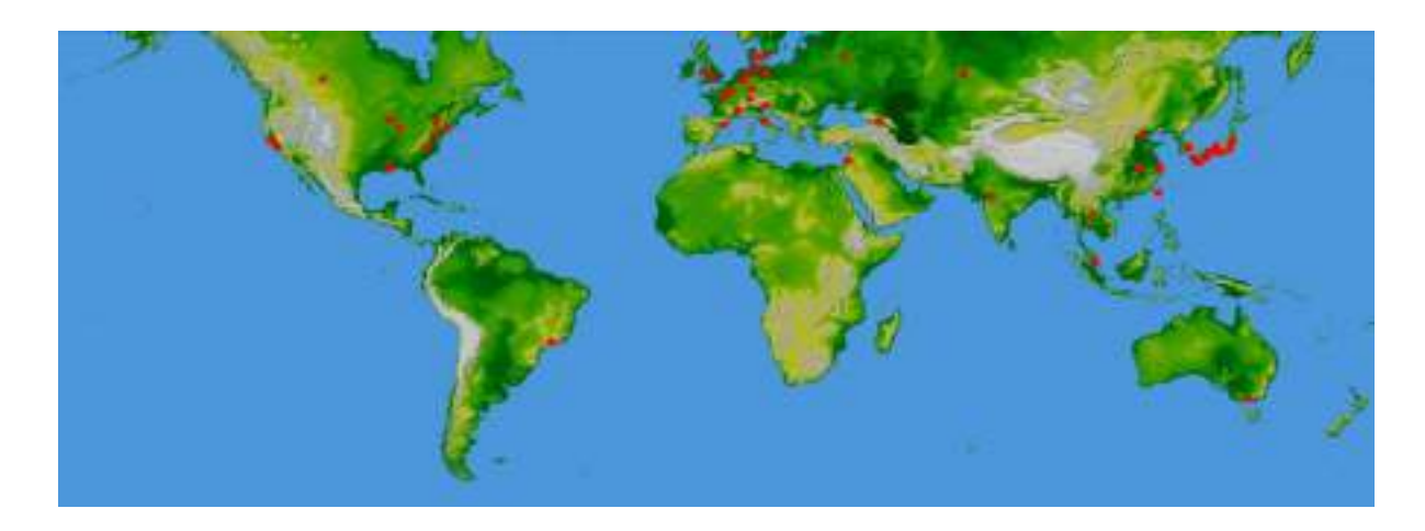
Figure 1: Locations of Synchrotron Light Sources<sup>1</sup>

Synchrotron radiation has revolutionized basic and applied research in many scientific and technological disciplines, leading to a proliferation of facilities around the world. The website <u>lightsources.org</u> has links to 47 synchrotron radiation research facilities based on electron storage rings in 23 countries in operation, construction or planning. Fig. 1 depicts the location of operating light sources worldwide. Several facilities operate more than one ring, so more than 47 rings are in operation. Also, the list of facilities in construction is not complete. For example, a 1.5 GeV facility nearing completion in Poland is not included. See tango-controls.org/Events/meetings/october-2010/polish-synchrotron-tango-2010.10.pdf.