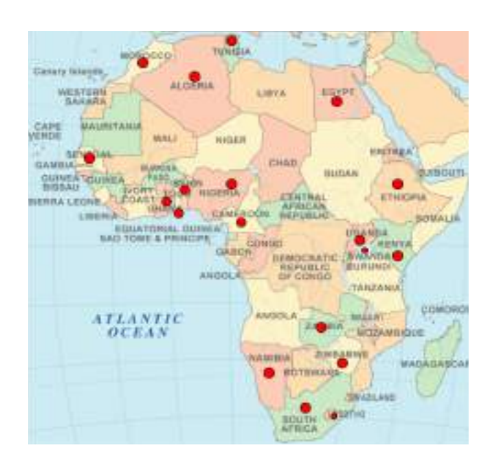
Figure 3: Countries with ALC Member Institutions<sup>2</sup>

Since the ALC started receiving funding in 2006, mostly from the government of South Africa, its successes have included the following: