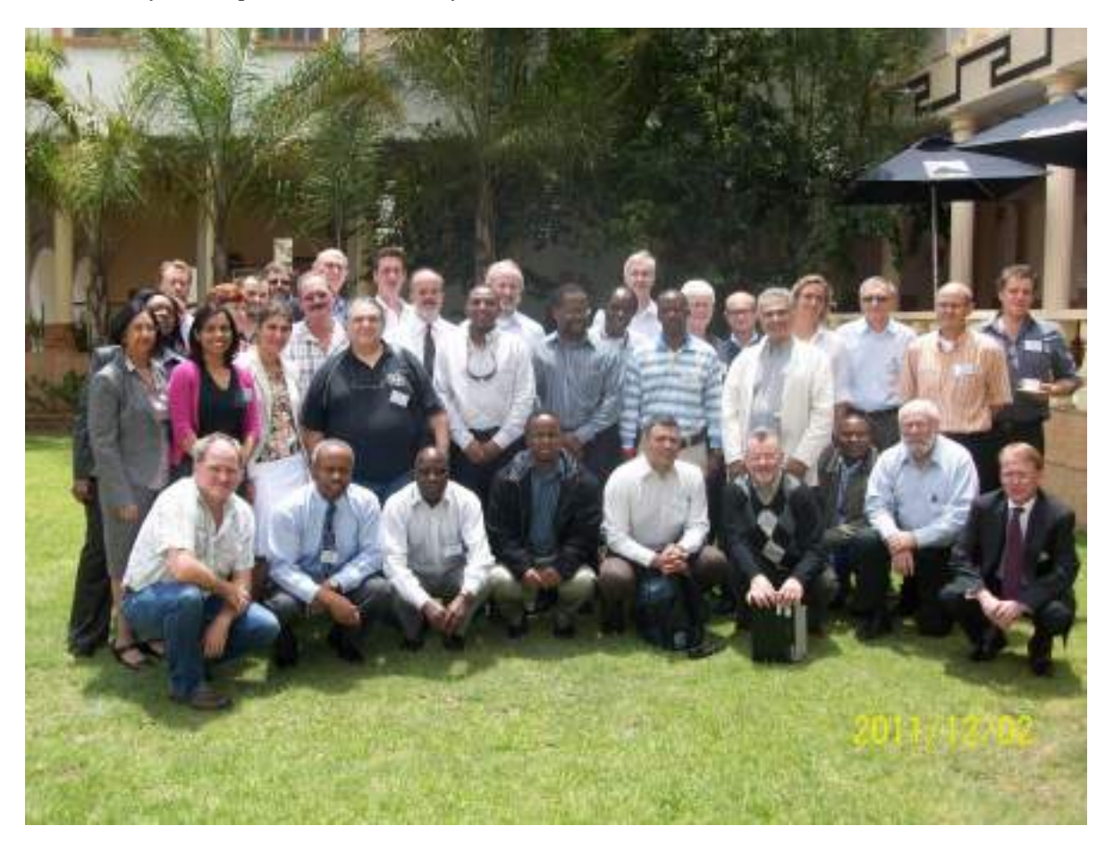
Figure 4<sup>3</sup> Attendees at the 2011 SRRIC/SAIP Synchrotron Science Workshop, Pretoria, 2011