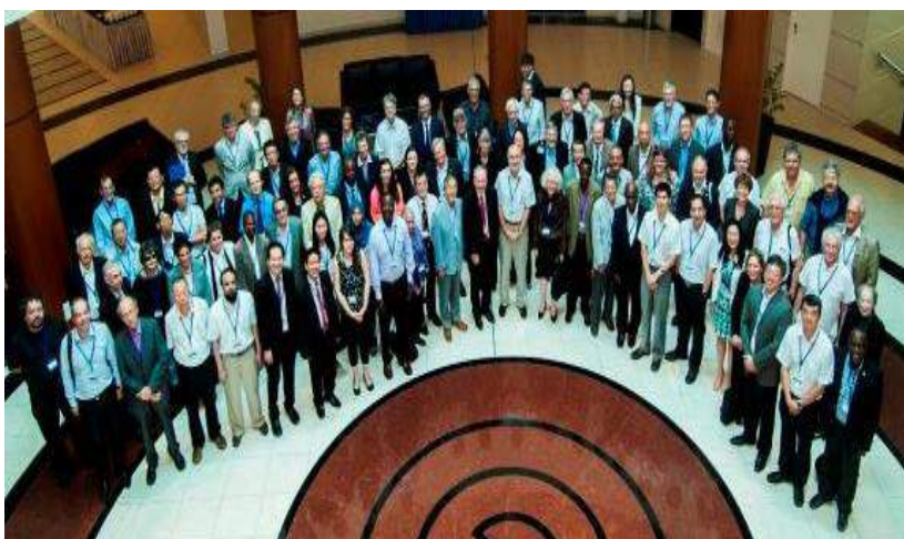
1 2 Group Photo of General Assembly Participants