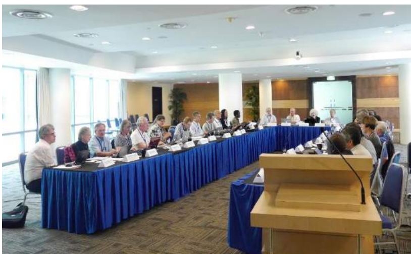
4 Executive Council & Commission Chair Meeting