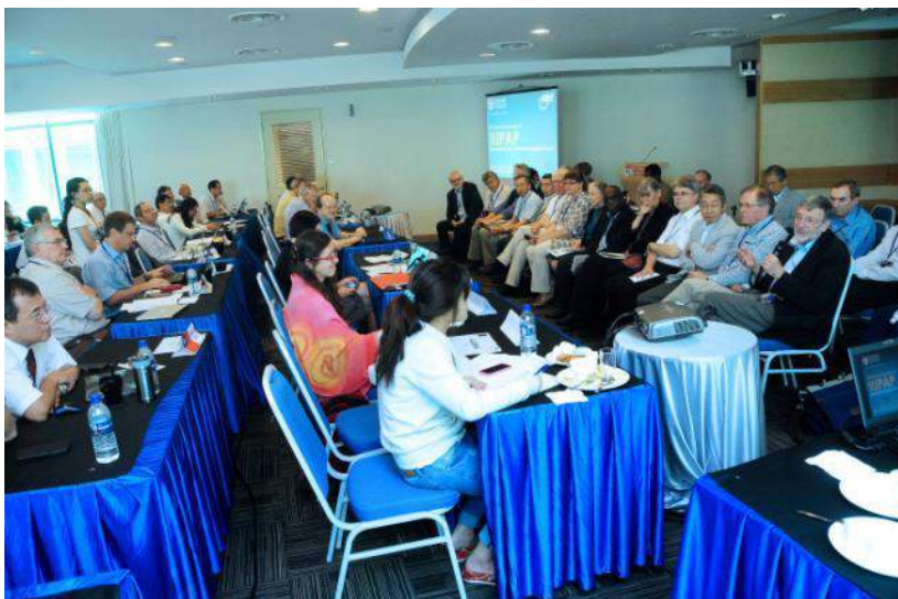
5 Panel of Chairs answering questions