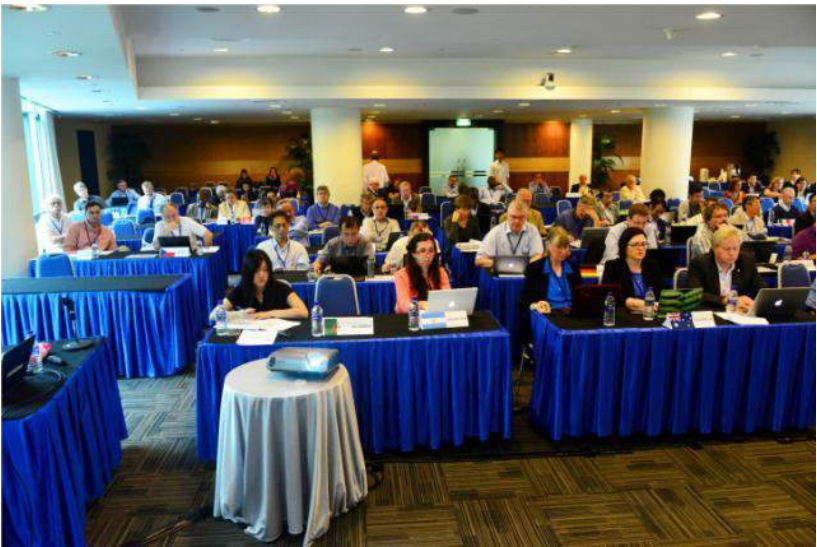
8 General Assembly participants