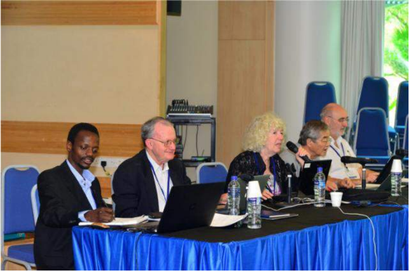
7 Executive Council