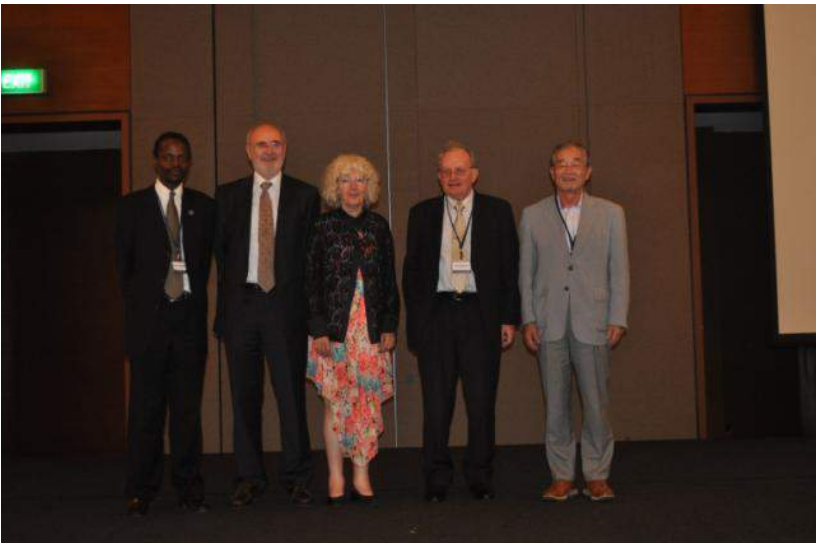
1 6 Executive Council 2011-2014