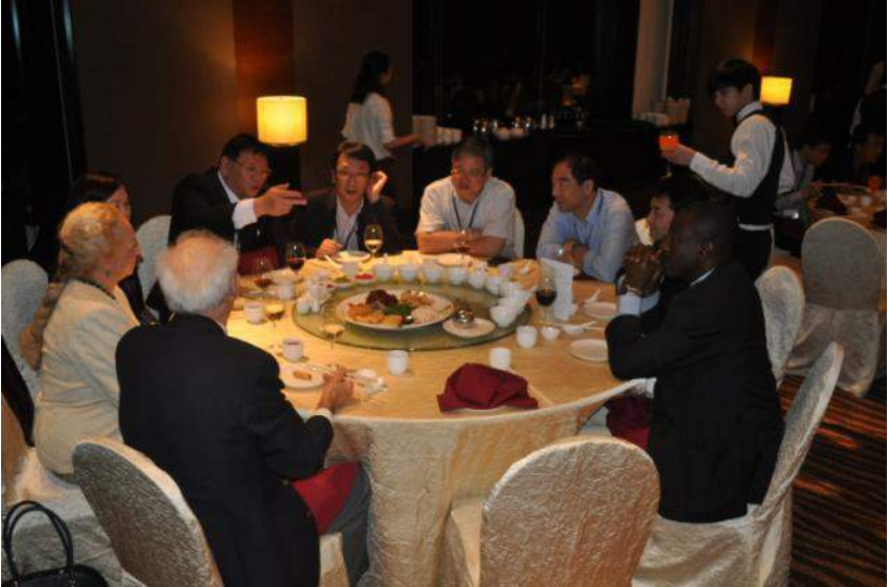
1 5 Participants at the Banquet