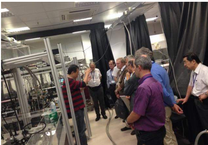
1 1 Participants visiting the lab