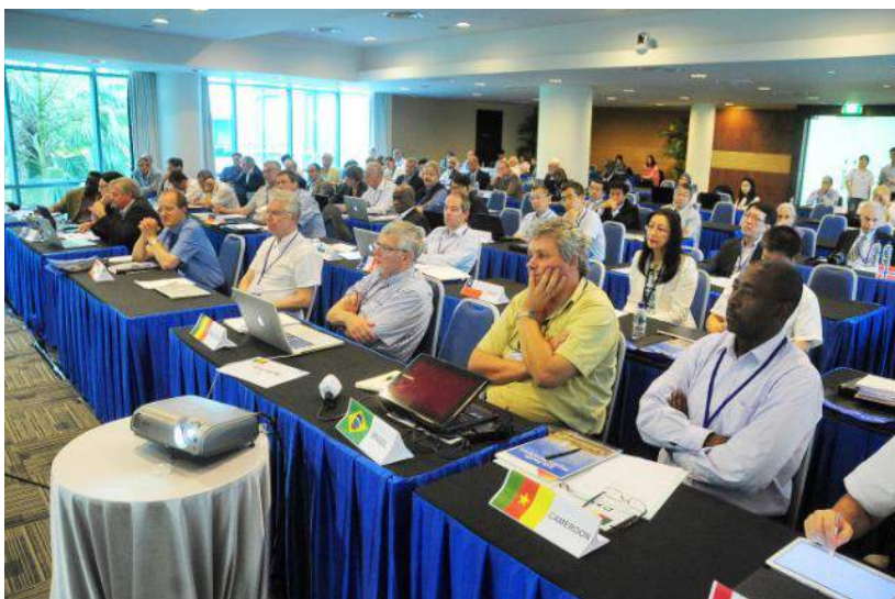
6 IUPAP Liaison members