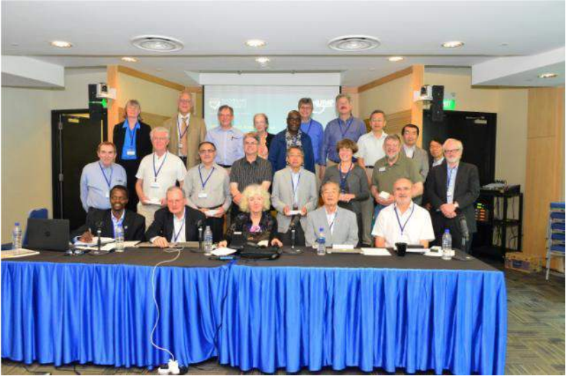
1 3 Executive Council, Commission & Affiliate Commission Chairs 2011-2014