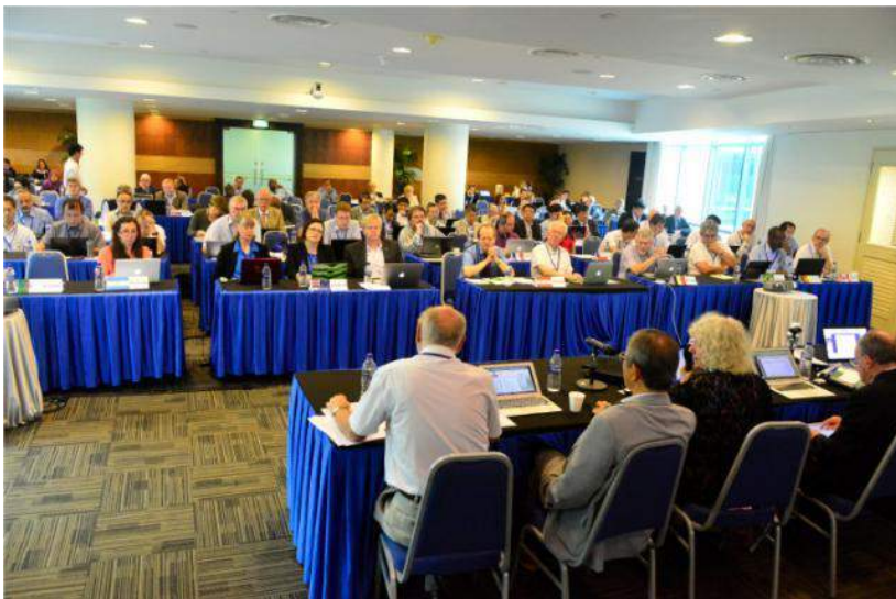
9 General Assembly participants