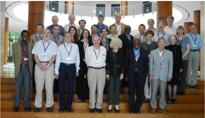
1 4 Executive Council, Commission & Affiliate Commission Chairs 2014 – 2017