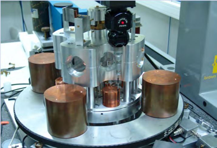
Figure 2 The G experiment carried out at the Bureau International des Poids et Mesures (BIPM) by Quinn and others. At the beginning of May 2016, this experiment was shipped to the National Institute of Standards and Technology (NIST). There the experimental apparatus will be used in another measurement campaign.

Four factors make it difficult to measure G : (1) The forces are small. Typically, the gravitational forces are well below 1 \mu\text{N} . (2) The gravitational background fields generated by the Earth and the surroundings cannot be shielded. (3) The density profile of the masses must be well known which can be challenging at the level of 10^{-5} . (4) The exact mass distribution of the experiment must be known and a numerical mass integration must be conducted to convert the measurement into G .