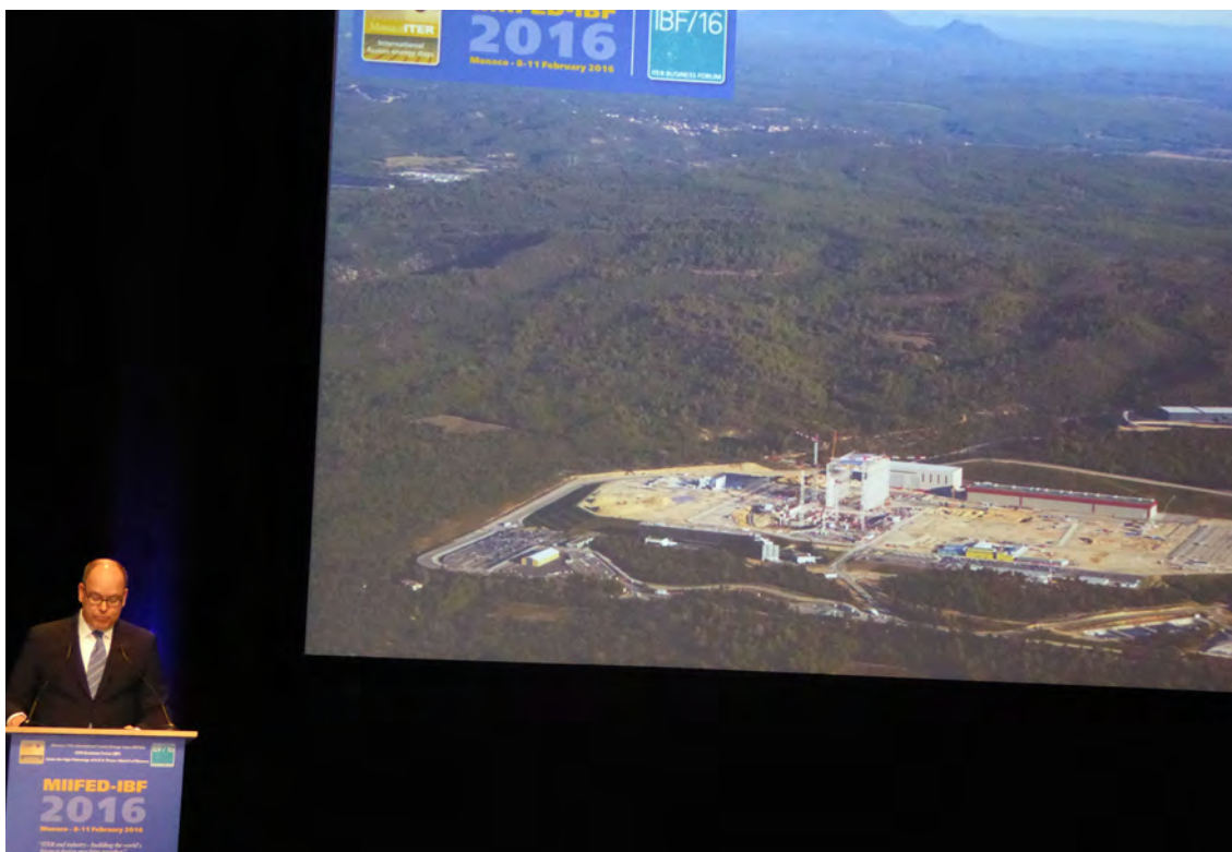
H.S.H. Prince Albert II of Monaco in his answer stated: “You have the way, we have the will” . In the background is a picture of the construction site of ITER in Cadarache (F).

The ITER project is a key element in all international roadmaps that move towards the industrialisation of fusion electricity. It is therefore natural that the Commission C16 Plasma Physics of IUPAP is fully associated with MIIFED.