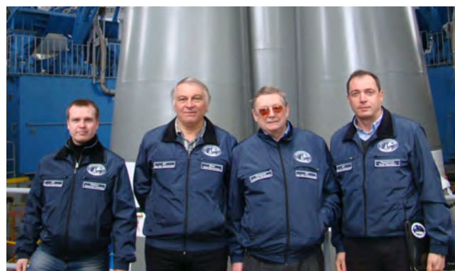
MSU team at the spaceport.