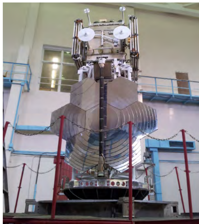
Satellite “Lomonosov” during testing. In the foreground - ultraviolet telescope mirror for the registration of cosmic rays of ultra-high energies.

Details about the project “Lomonosov” can be found on the site lomonosov.sinp.msu.ru