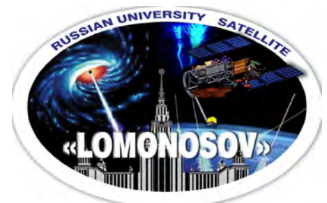
“Lomonosov” project emblem

It is known that the Earth’s atmosphere is a “target” for various types of cosmic radiation entering in. This radiation contains cosmic rays which are charged particles of the solar, galactic and extragalactic origin. High-energy particles in the atmosphere give rise to cascades of secondary particles - Extensive Air Showers (EAS), by