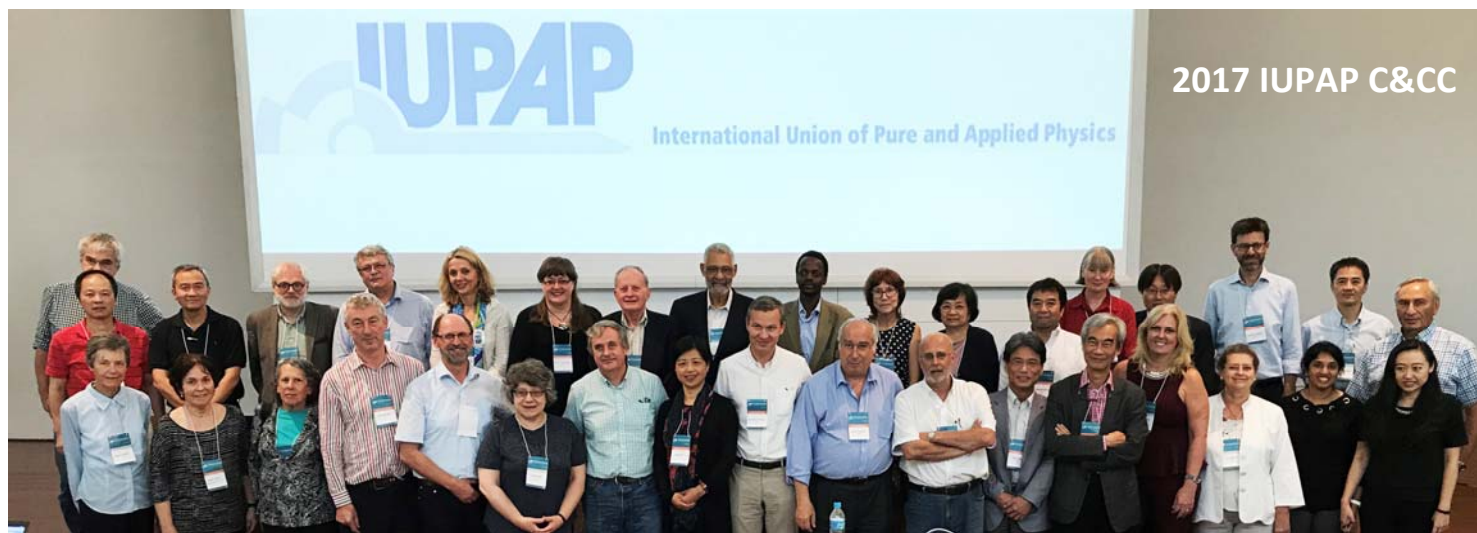
2017 IUPAP C&C

The first IUPAP Commission on Biological Physics (IUPAP C6) was formally created at the 20th IUPAP General Assembly, held in Dresden in 1990. Over the past 27 years, the field of biological physics has experienced tremendous growth. IUPAP C6 has been playing an active role in promoting the worldwide exchange in biological physics, including organizing International Conferences on Biological Physics and recognizing outstanding young scientists in biological physics with the prestigious IUPAP C6 Young Scientist Prizes (YSP).