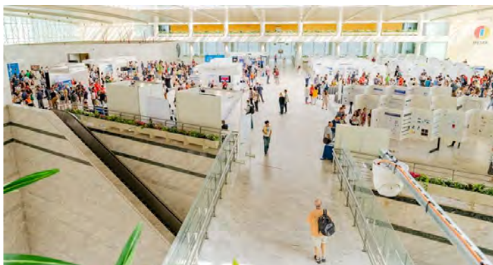
Posters and company stands

The sessions on instrumentation were completed by two symposia. The first one was organized by the ARBRE-MOBIEU COST Action and entitled emerging breakthrough molecular-scale biophysics methodologies . Several novel approaches and technology developments were presented: mass spectrometry approaches to investigate protein conformational changes and dynamics; novel chemical biology strategies for atomic resolution structural information; AFM single molecule approach allowing to combine information on interactions forces, energy landscapes and kinetic rate constants; \mu -Raman and \mu -Brillouin spectroscopy with sub-nanometric resolution for biological material characterization; newly developed mass photometry approaches based on interferometric scattering microscopy for protein dynamics and interactions studies; and development of two micro- and nano-structured surface architectures for label-free spectroscopic and microscopic protein studies.