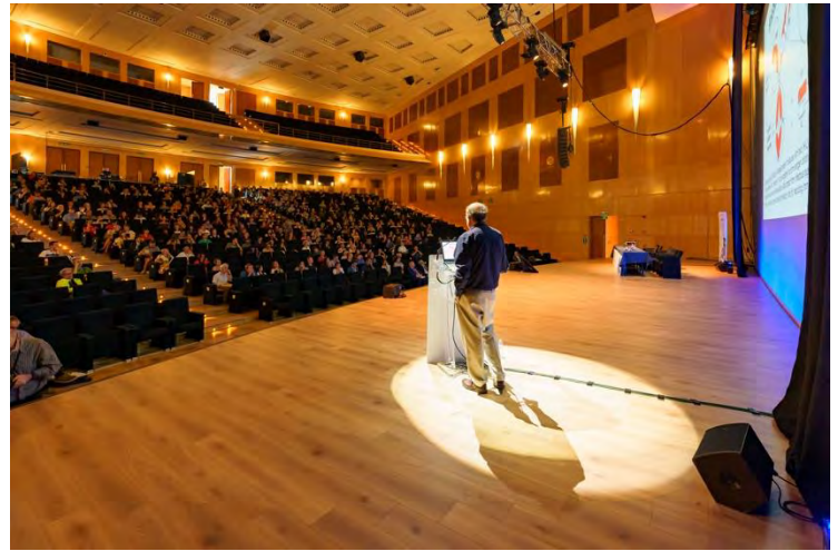
Gregory P. Winter in his plenary lecture on Saturday 20 th .

Mechanochemistry was also present in a number of symposia. There was a symposium on mechanobiology and one on molecular motors , that covered a rather coherent overview of different studies on classical motor systems. Talks dealt with different biophysical approaches to muscle contraction, operation of DNA polymerases during replication, and actin cytoskeleton pushing forces as collective molecular motors. Mechanical properties were also addressed in the symposium biophysics of the cytoskeleton , where we had talks on neural intermediate filaments that serve as shock absorbers under mechanical compression, the mechanical and assembly properties of microtubules on the reconstitution of mitotic spindles, and the spindle dynamics in cell division and polarization. The mechanics of the cytoskeleton in reconstituted systems was also present at Patricia Bassereau's (Curie Institute, CNRS) plenary lecture, connected with membrane curvature and its effect on lipid and protein sorting.